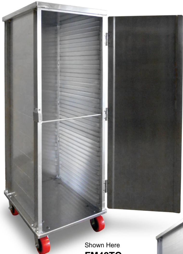
Shown Here FM40TC