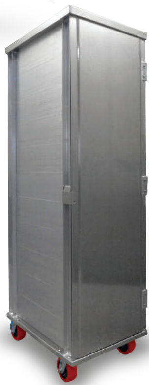
Shown Here FM44TC