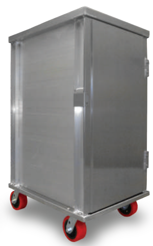
Shown Here FM24TC