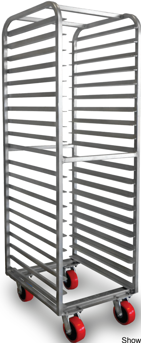
Shown Here FM203SPE